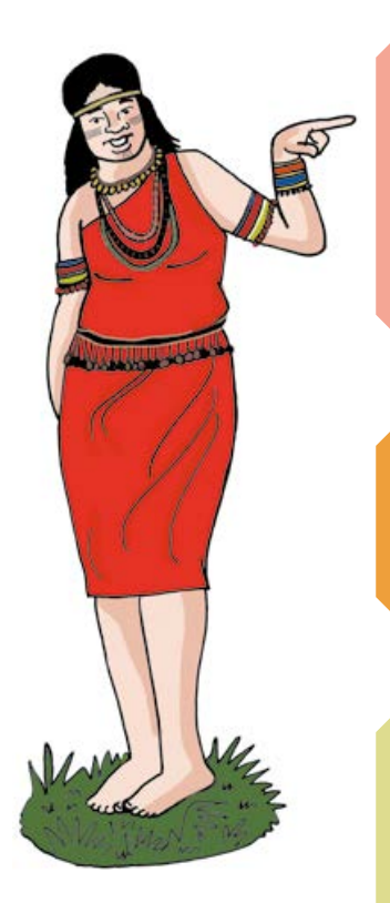
Figure N° 1. Investigation process

Why was a specific action taken? What were the causes? What were the results? Who was involved?